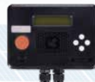
Beehive Data Aggregation Device