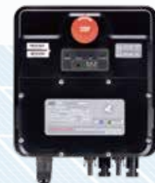
Beebox-H Optimizer Initiator