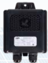
Swarm Data Acquisition Unit